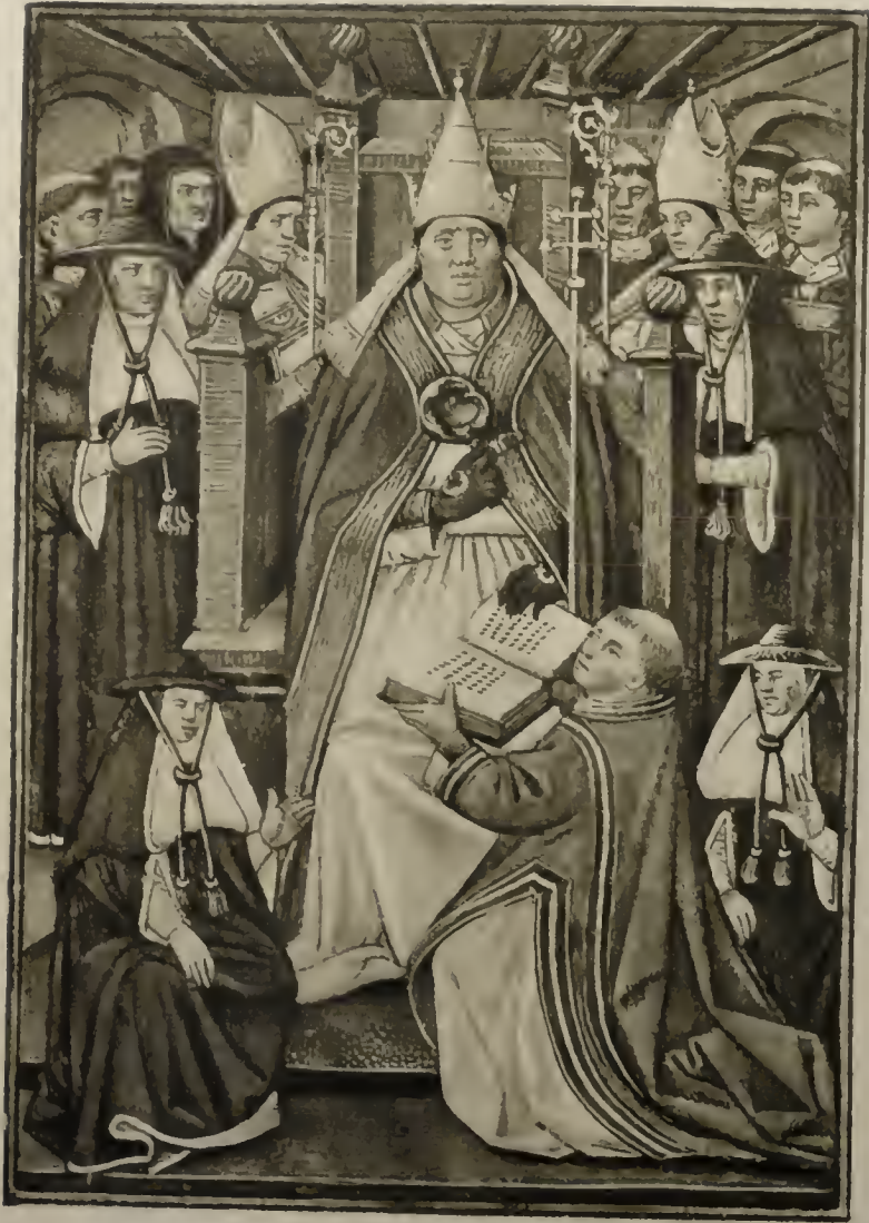
St. Augustine. "La Cité de Dieu." from a manuscript in the Musée de Chantilly.